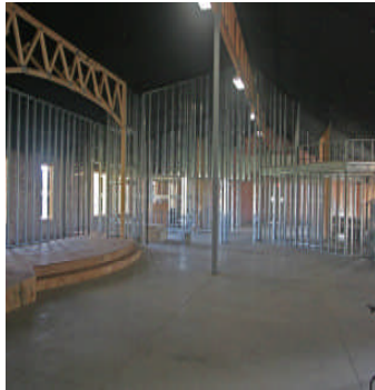
Unfinished second floor of the Schrader Center.

We feel God is leading us to build for the future, to accommodate and grow Children, Youth, and Adult ministries. We will open our doors to the local community, and abroad, by preparing the people of Grace to go out in service as disciples of Christ to the world.